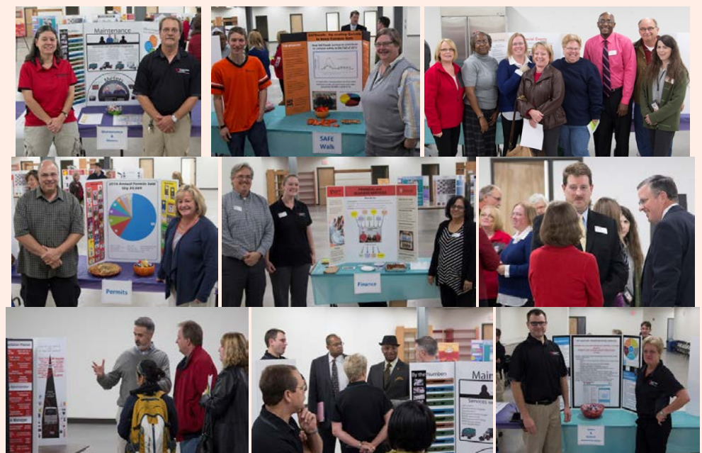
Additional event photos will be posted to the FP&M website in the Staff Resources area soon.